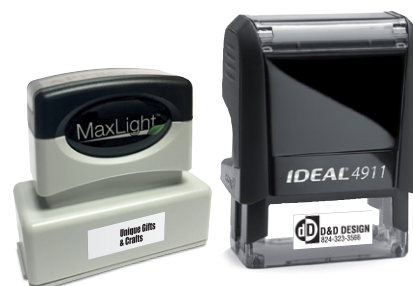
All private label sizes are 1-1/2" x 1/2"

We offer FREE Private Labeling on stamps. Just send us the copy and logo. (Limit: 3 lines of copy with no logo or 2 lines of copy with logo. Available inks: red, black, blue, green, purple