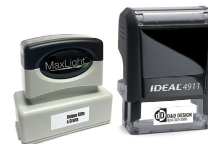
All private label sizes are 1-1/2" x 1/2"

*Turnaround times shown above are estimated. Orders received after 4:00 p.m. (your time zone) will be counted as the following day's business. Rush orders available. Call for details.